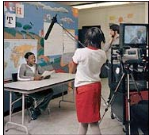
ON THE AIR Teenagers in Truce, an after-school program, learn video production skills.

After welfare reform passed in 1996, the national debate on poverty seemed simply to shut down. Most conservatives explain poverty by looking to culture and behavior: bad parenting, high out-of-wedlock birth rates, teenagers who don't know the value of an honest day's work. To most liberals, the real problems are economic: underfinanced public schools and a dearth of well-paying semiskilled jobs, which make it nearly impossible for families to pull themselves out of poverty. Canada says he believes that both assumptions are true. He agrees that the economy is stacked against poor people no matter how hard they work, but he also thinks that poor parents aren't doing a good enough job of rearing their children. What makes Canada's project unique is that it addresses both problems at once. He keeps the liberals happy by pouring money into schools and day-care centers and after-school programs, and he satisfies the conservatives by directly taking on the problems of inadequate parenting and the cultural disadvantages of a ghetto home life. It's not just that he's trying to work both sides of the ideological street. It's that Canada has concluded that neither approach has a chance of working alone. Fix the schools without fixing the families and the community, and children will fail; but they will also fail if you improve the surrounding community without fixing the schools.