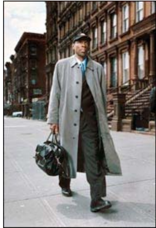
Geoffrey Canada in the zone, his Zone -- 60 blocks of Harlem.

At around the same time, he was invited by Marian Wright Edelman, the president of the Children's Defense Fund, to join a group she had recently founded called the Black Community Crusade for Children. Once a year, she brought together two dozen leaders from across the country who were trying to solve the problems of poor black children. They met down at a farm in Tennessee that had once been owned by Alex Haley, the author of "Roots," and they spent a few days comparing notes on the crisis in America's poor neighborhoods. For Canada, the good news at these discussions was that he wasn't alone -- but that was the bad news, too. All across the country, in big cities and in small towns, well-meaning nonprofits were finding the same thing: they were helping a few kids, getting them out of the ghettos and off the streets and sometimes even into college, but for the masses of poor children, and especially those who were black, nothing was changing; those children were still falling behind in school, scoring below average on reading tests and staying poor.