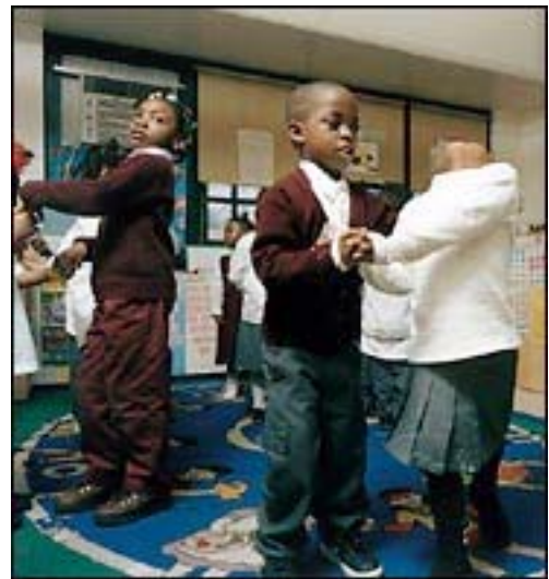
ON THE FLOOR Preschoolers in Harlem Gems are taught music and movement, French and reading.

While the new building is going up, Canada works on Park Avenue between 130th Street and 131st Street, in a small office in a six-story building that always seems to be under renovation. When I visited him on an icy afternoon in February, the